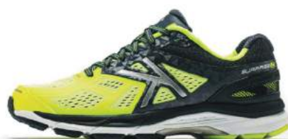
935 - Neon Yellow/Dark Blue