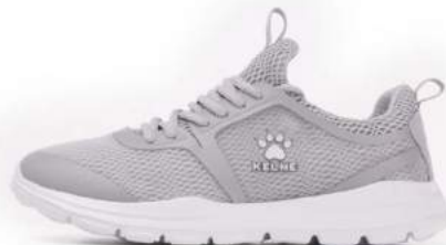
200 - Gray (MEN)