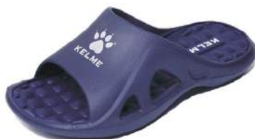
416 - Dark Blue