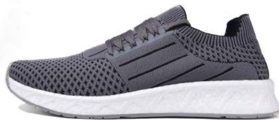
200 - GRAY