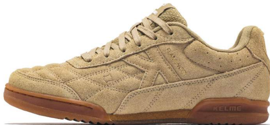
733 - Wheat