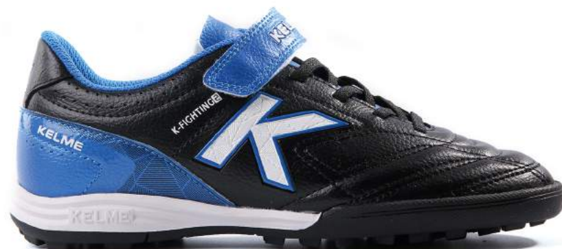
002 - Black/Royal Blue