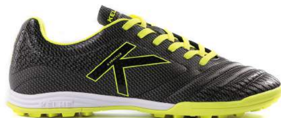
000 - Black

with carbon fiber synthetic leather and new upper streamline sewing line and mesh holes added to the heel to improve air permeability. EVA cushion mid-sole with loop nail bottom enhance the grip and steering stability, which can meet needs of daily training and small-scale competition in artificial grass ground.