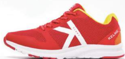
662 - China Red

Adopting breathable mesh cloth, ultra-thin process support, and resilient and wearable lightweight outsole which is well-fitted, breathable, and comfortable, can meet the needs of exercise and daily life.