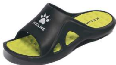
010 - Black/Neon Green