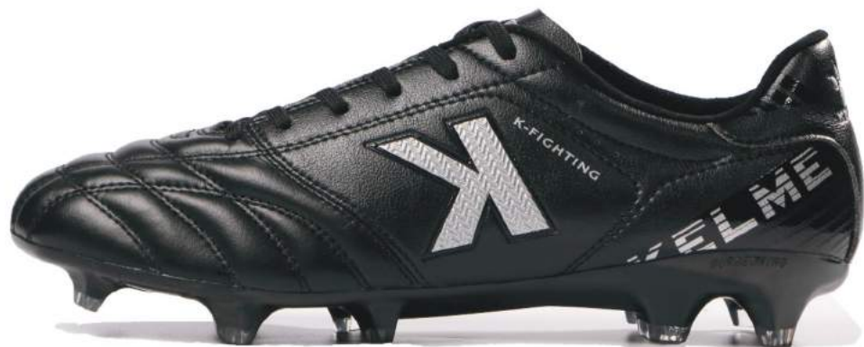
000 - Black