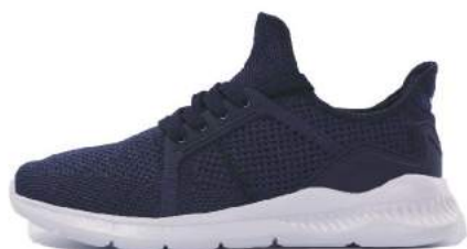
416 - Dark Blue