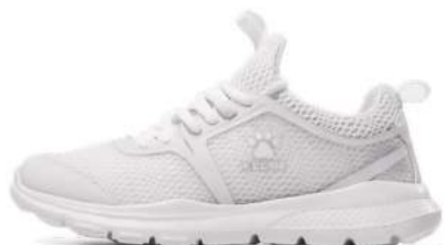
100 - White (MEN/WOMEN)

Lightweight rebound outsole which is breathable and comfortable.