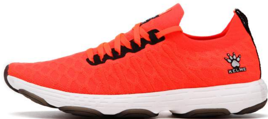
808 - ORANGE