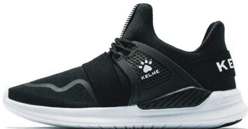
000 - Black