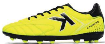
905 - Neon Yellow