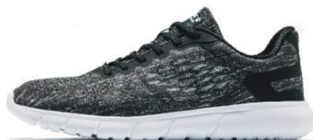
044 - Middle Gray (MEN)