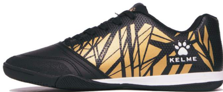
037 - Black/Golden