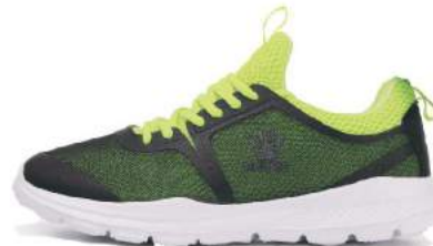
933- Neon Green/Black (MEN)