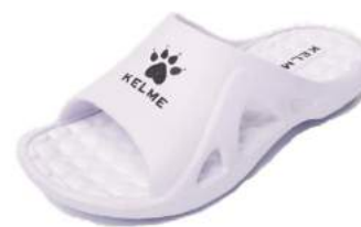
100 - White