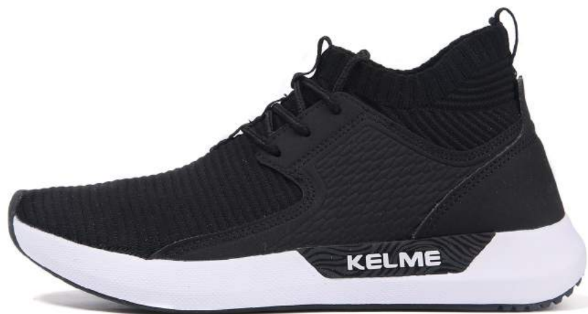
000 - BLACK