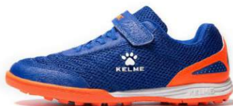
417 - Sapphire Blue