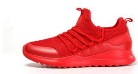
600 - Red