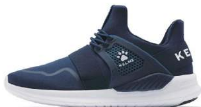
416 - Dark Blue (MEN)