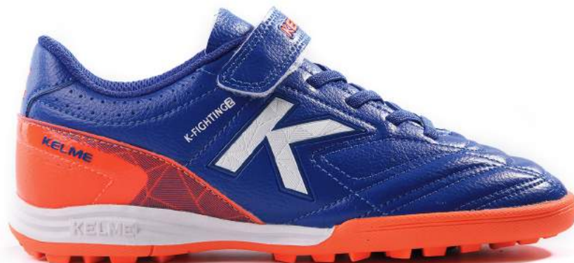
413 - Sapphire Blue/Orange