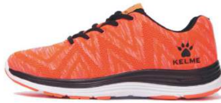
907 - Neon Orange (MEN/WOMEN)