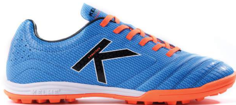
417 - Sapphire Blue