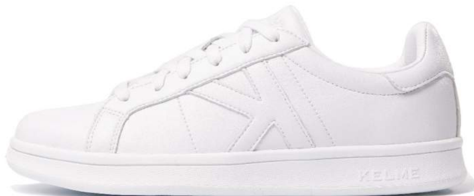
100 - White