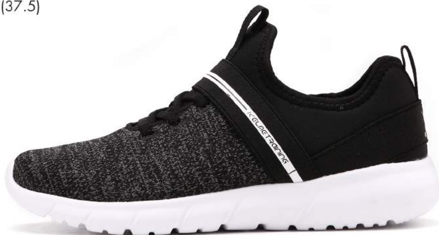
000 - Black