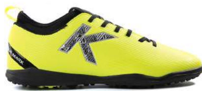
930 - Neon Yellow/Black