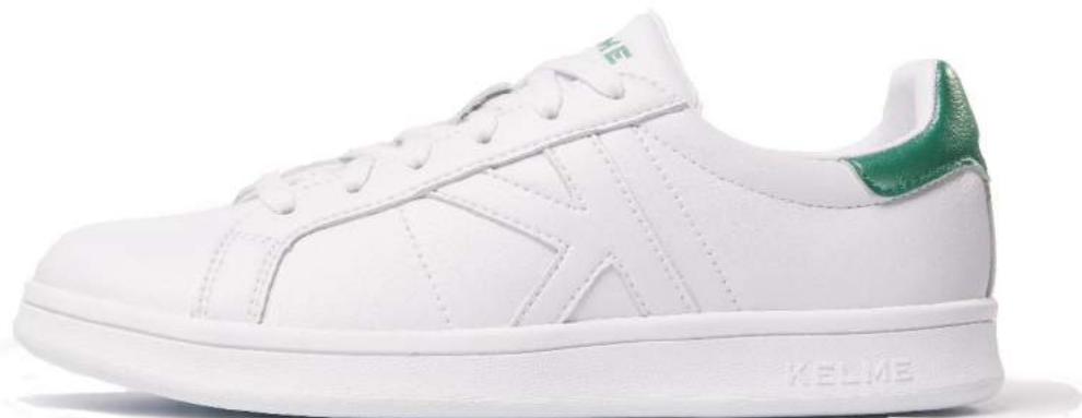
105 - White/Green