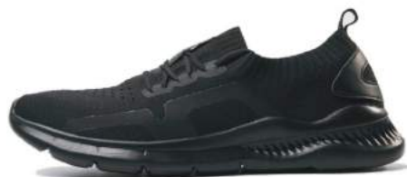
000 - Black