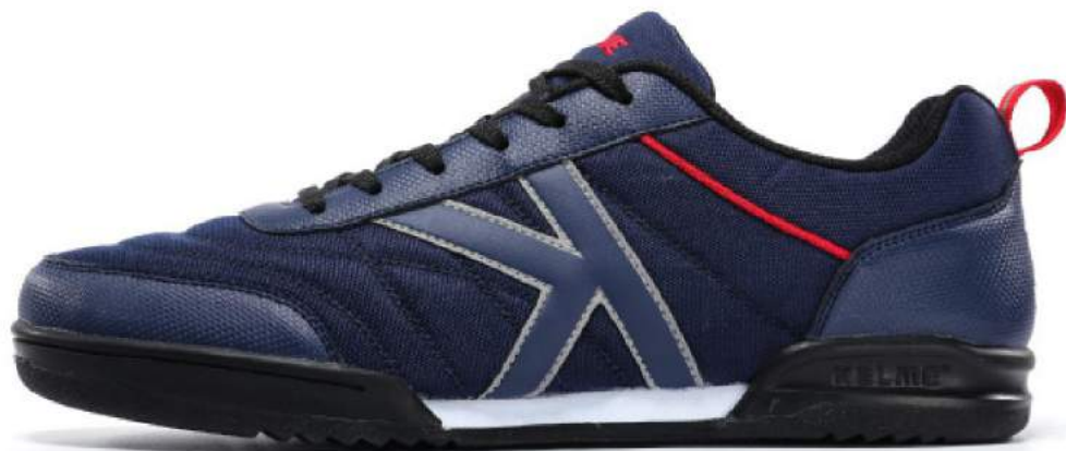
416 - Dark Blue