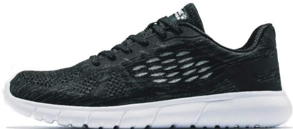
061 - Cool Black (MEN/WOMEN)

Sizes: 40-44(42.5)-MEN, 35-39(37.5)-WOMEN