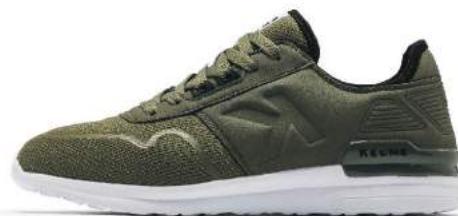
308 - Army Green (MEN)