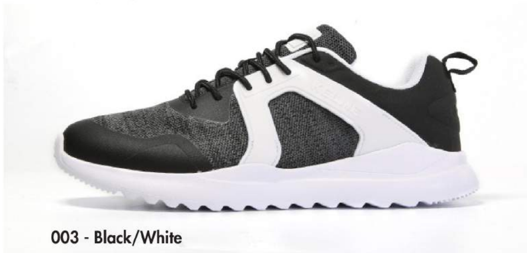
003 - Black/White