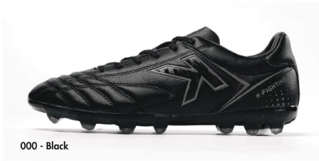
000 - Black