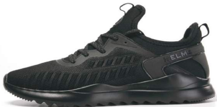
000 - Black