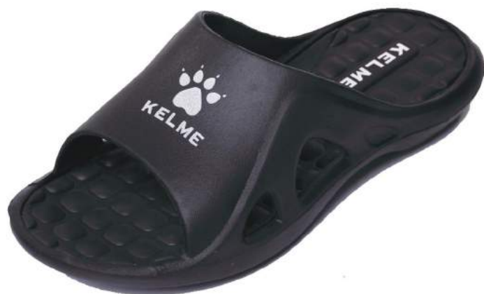
000 - Black