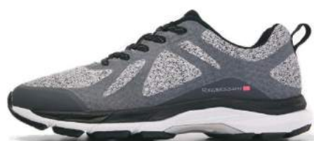
201 - Dark Gray