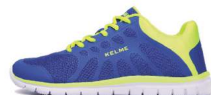
415 - Royal Blue/Neon Green