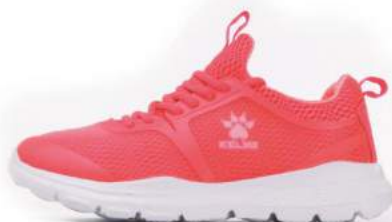
608 - Process Red (WOMEN)