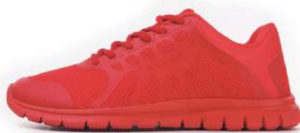
600 - Red