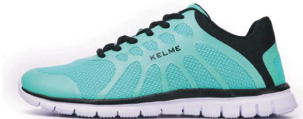
353- Mint Green/Black