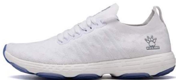
100 - WHITE