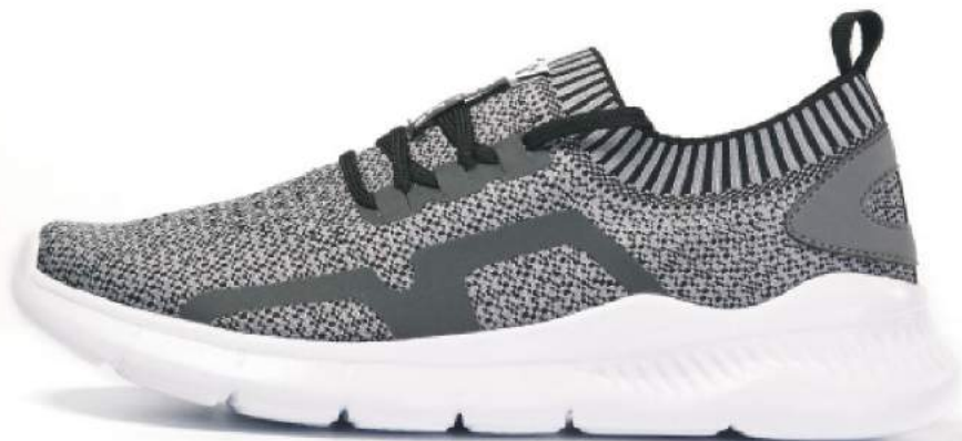
201 - Dark Gray