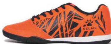
932 - Neon Orange/Black