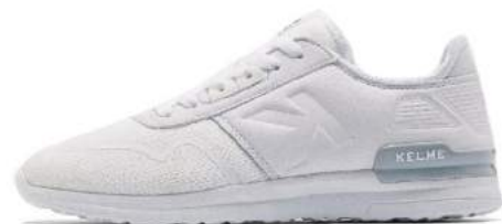
100 - White (WOMEN)