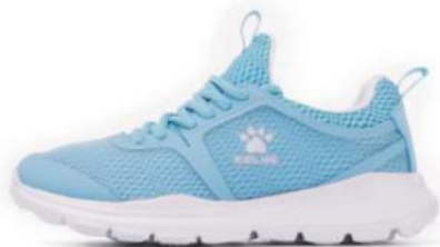
328- Mint Green (WOMEN)