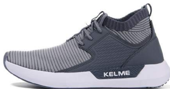
200 - GRAY