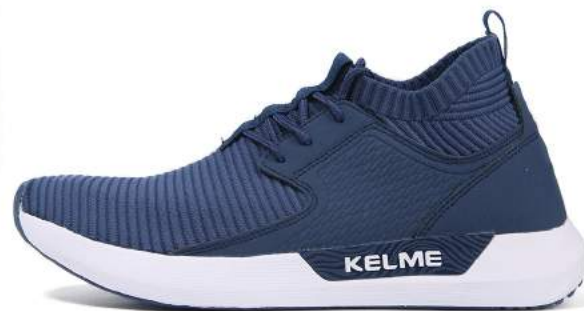
432 - BLUE