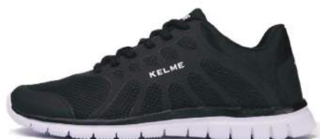
003 - Black/White

Lightweight and wearable, pliable outsole, which is light and cushioned, and suitable for daily exercise and life.