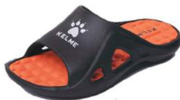
023 - Black/Orange