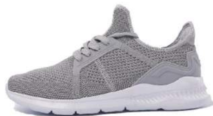
202 - Light Gray