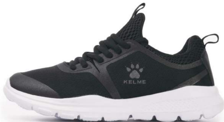
000 - Black (MEN/WOMEN)