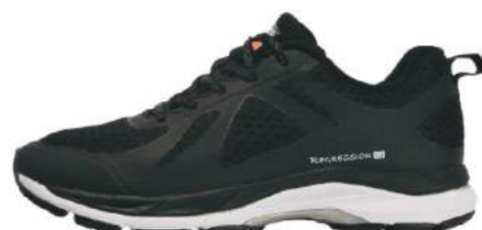
000 - Black