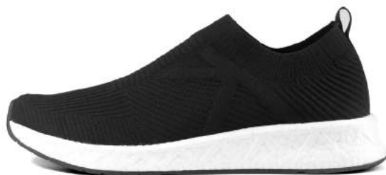
000 - BLACK