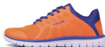
819 - Bright Orange/Blue