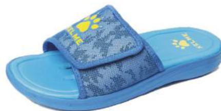
417 - Sapphire Blue (6881301)