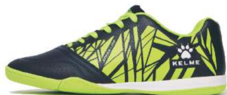
440 - Dark Blue/Neon Green