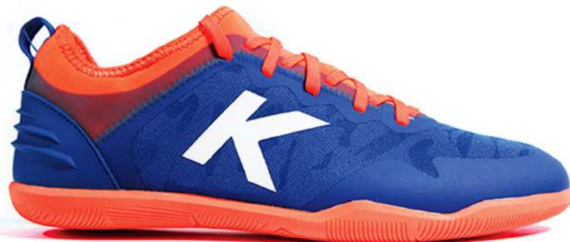
413 - Sapphire Blue/Orange