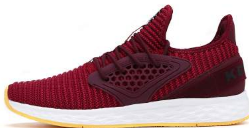
609 - WINE RED