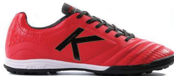
611 - Red/Black