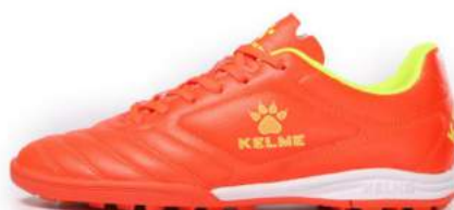
907 - Neon Orange