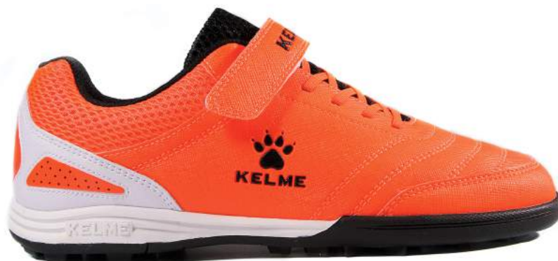
907 - Neon Orange