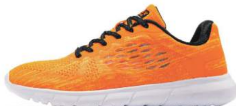
807 - Bright Orange (MEN)