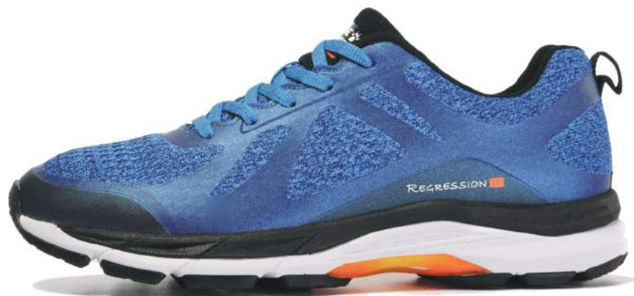
421 - Sea Blue