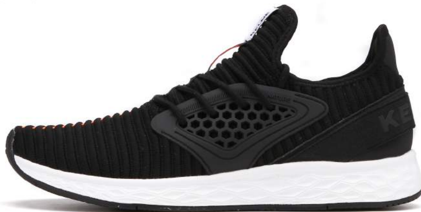
000 - BLACK