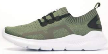
308 - Army Green