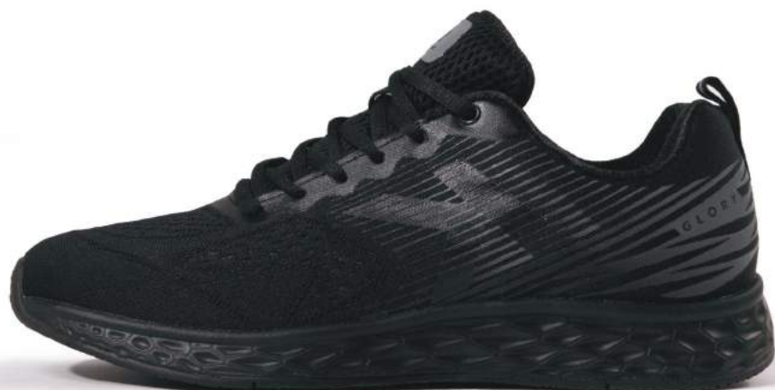
061 - Cool Black