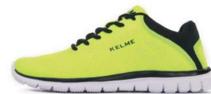
933 - Neon Green/Black