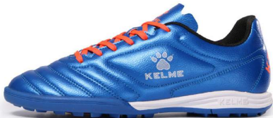
417 - Sapphire Blue