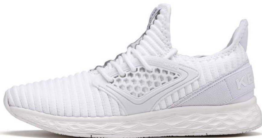
100 - WHITE