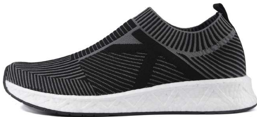
261 - DARK GRAY/BLACK