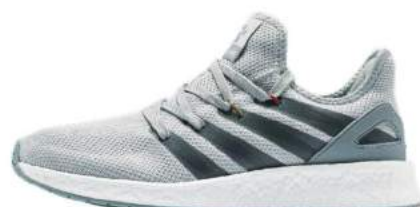
202 - Light Gray