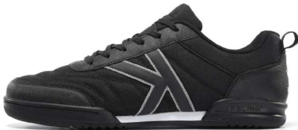
000 - Black