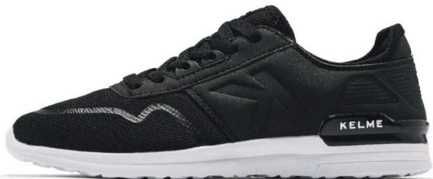
061 - Cool Black (MEN/WOMEN)

Sizes: 40-44(42.5)-MEN, 35-39(37.5)-WOMEN