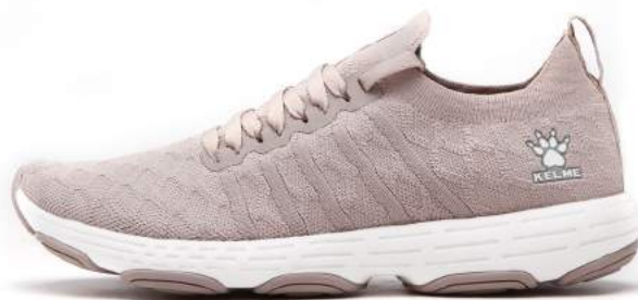
733 - WHEAT