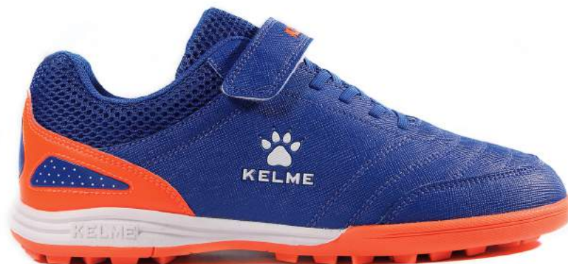
417 - Sapphire Blue