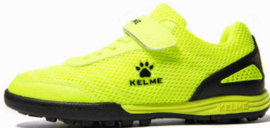
904 - Neon Green