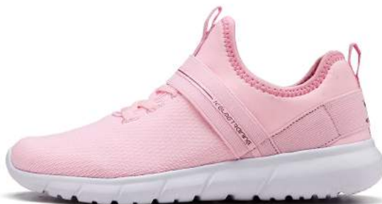
674 - Dynamic Pink