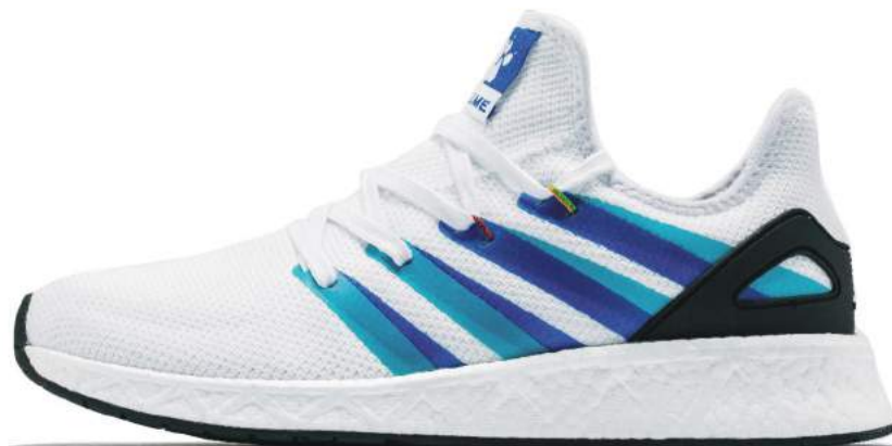
100 - White