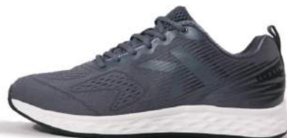
278 - Deep Cold Gray