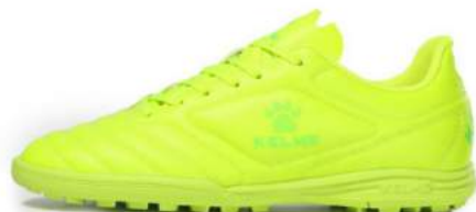
905 - Neon Yellow