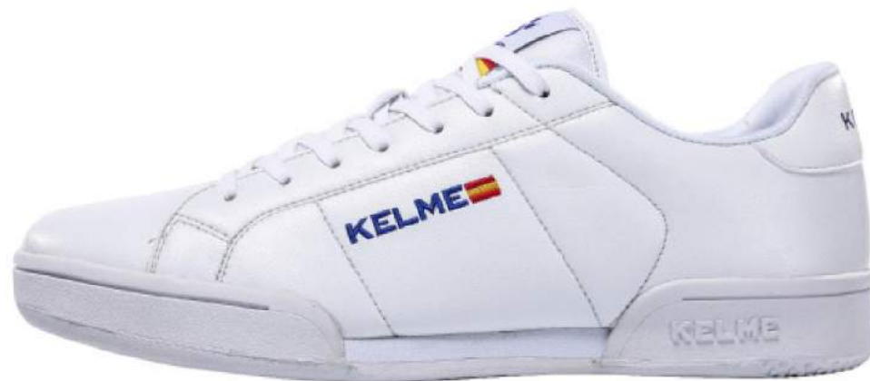
100 - White