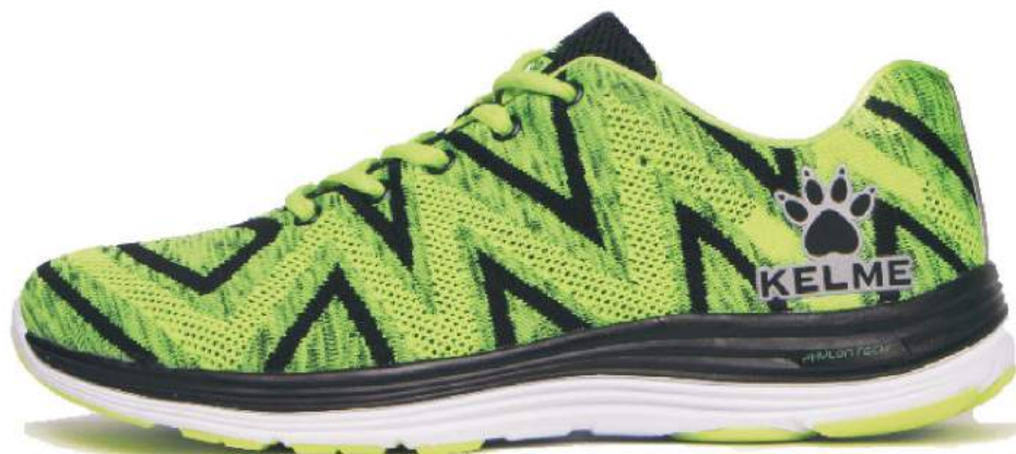
904 - Neon Green (MEN)