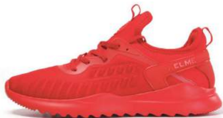
600 - Red