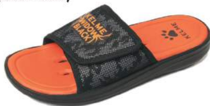
023 - Black/Orange (6881300)