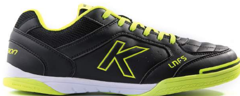
012 - Black/Neon Yellow