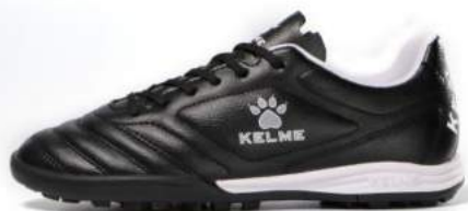
000 - Black

With smart TF outsole and exclusive football last, feel comfortable and flexible; Adopting simple and fashionable design and also bright color, bring football fan different feeling.