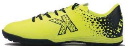
905 - Neon Yellow