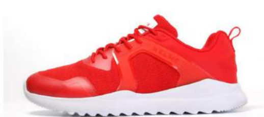
610 - Red/White