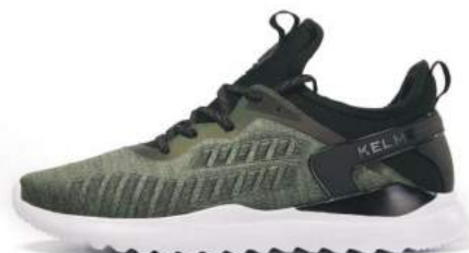
308 - Army Green