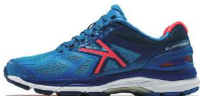
408 - Azure Blue