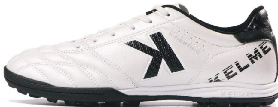
116 - Pearl White