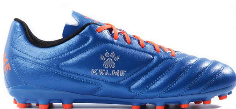
417 - Sapphire Blue