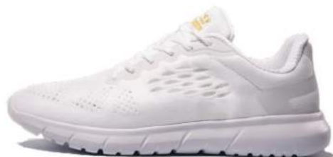
100 - White (WOMEN)