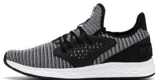
003 - BLACK/WHITE