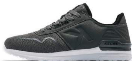
278- Deep Cool Gray (MEN)

Fashion classic casual shoes with simple design style, easy to match cloth. There are also LOVER STYLE for your selection.