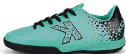
328 - Mint Green