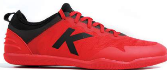
611 - Red/Black