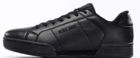
000 - Black