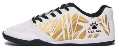
123 - White/Golden