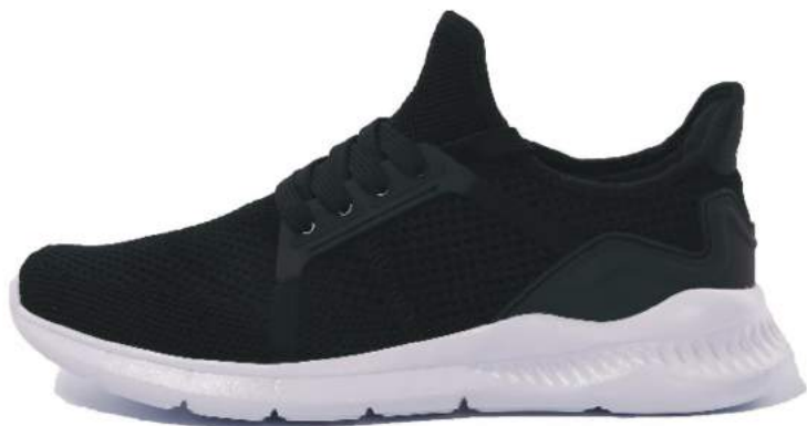
061 - Cool Black