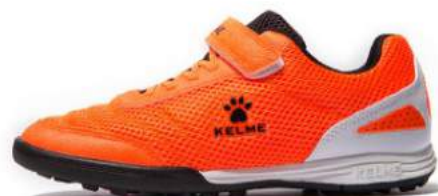
907 - Neon Orange