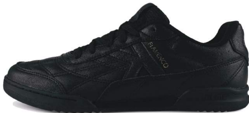
000 - Black