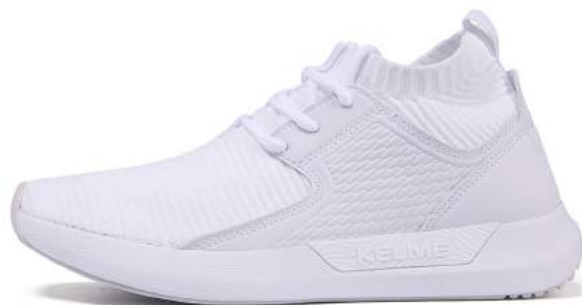
100 - WHITE