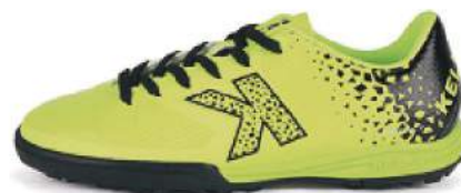
905 - Neon Yellow