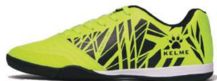
930- Neon Yellow/Black