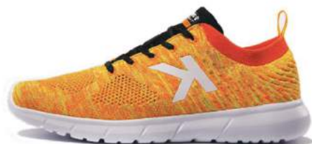
807 - Bright Orange

New flyknit upper design with most fashionable material, and high-resiliency EVA mid-sole, has the feature of soft comfortable, and faddish.