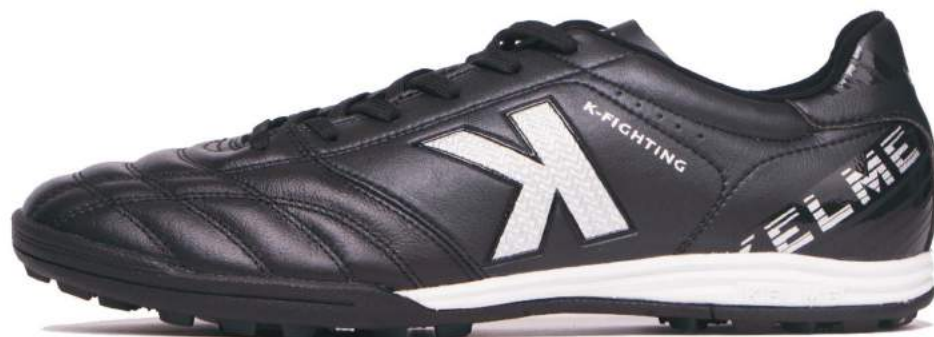
000 - Black