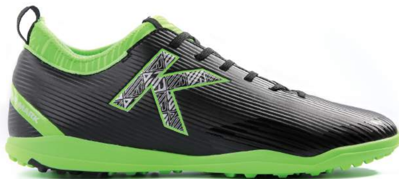
010 - Black/Neon Green