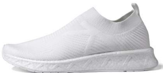
100 - WHITE