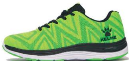
984 - Neon Yellow/Light Green (MEN/WOMEN)

Flyknit design on the vamp, which is comfortable and breathable, suitable for short distance running and casual wear.