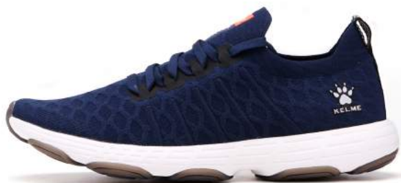
416 - DARK BLUE