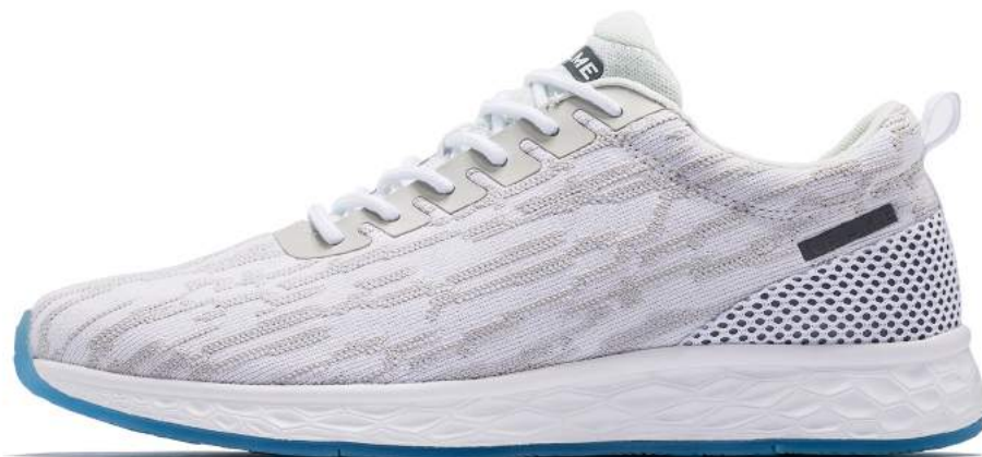
100 - WHITE