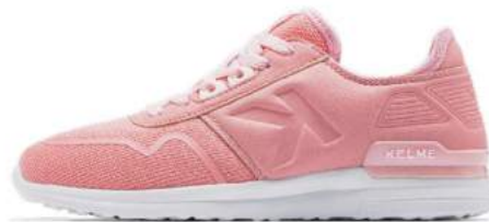
636 - Pink (WOMEN)