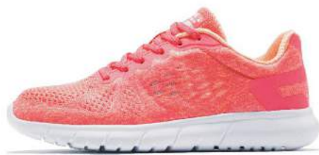
674 - Dynamic Pink (WOMEN)