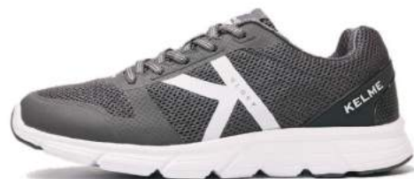
201 - Dark Gray