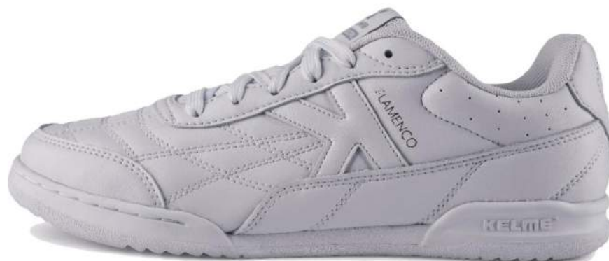
100 - White