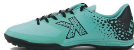
328 - Mint Green