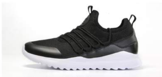
003 - Black/White