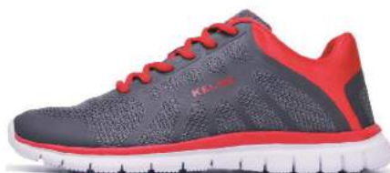
208 - Gray/Red