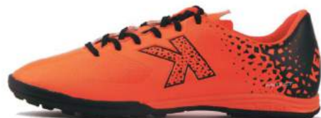
907 - Neon Orange