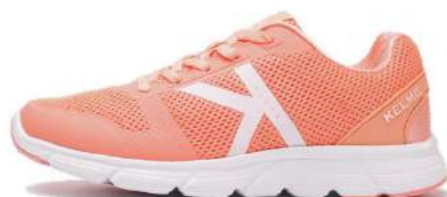
666 - Ice Pink