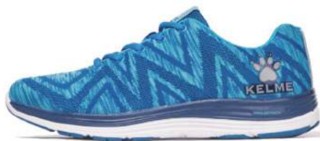
426 - Moon Blue (MEN)