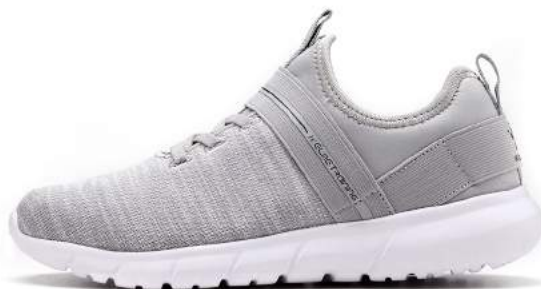
202 - Light Gray

Adopting convenient slip-on shoes and beautiful integrated vamp, big brand dedicated yarn, provide comfortable wearing experience.