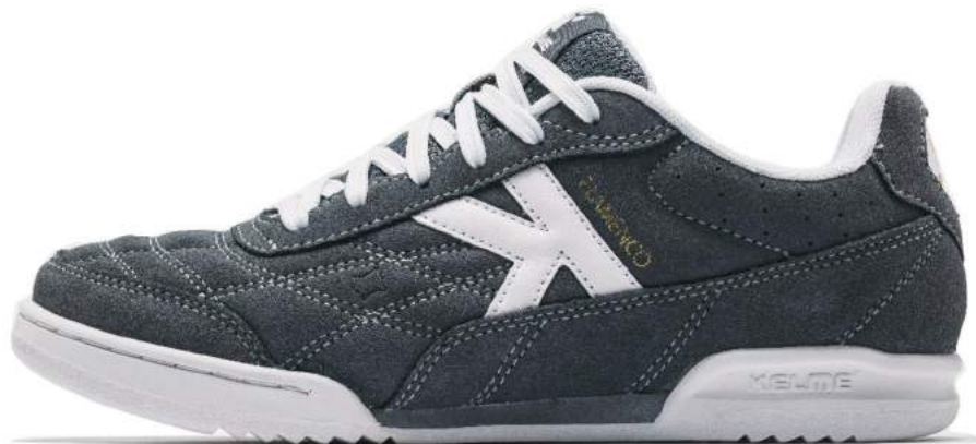
202 - Light Gray