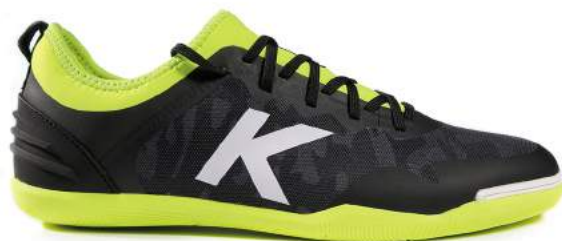
012 - Black/Neon Yellow

It is the revival of Spanish classic, with seamless technology and elastic shoes collar design, which is comfortable and suitable for training and casual wear with TPU supporting in back heel and antiskid rubber bottom.