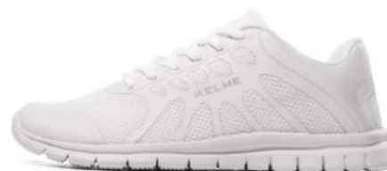
100 - White