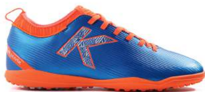
413 - Sapphire Blue/Orange