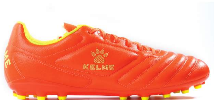
907 - Neon Orange