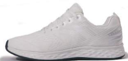
100 - White