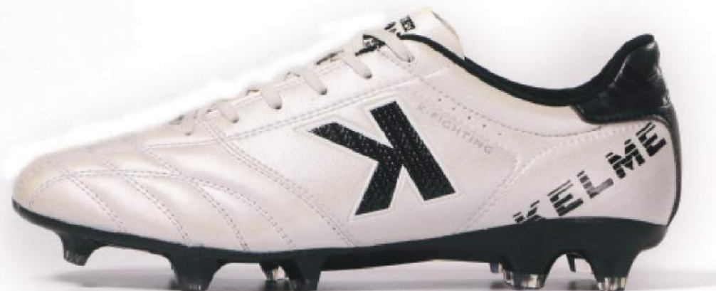
116 - Pearl White