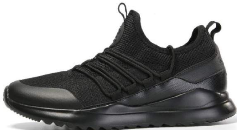
000 - Black