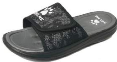
003 - Black/White (6881301)