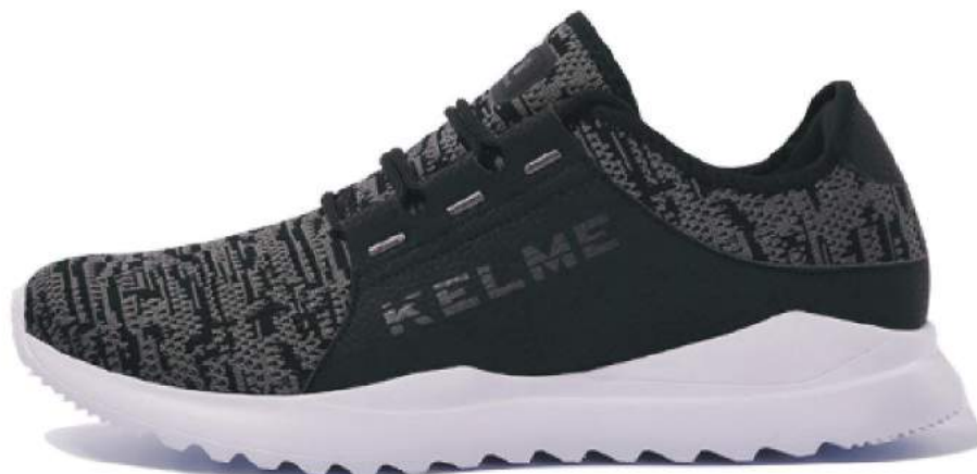
061 - Cool Black