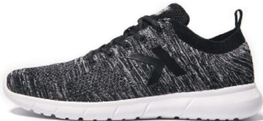
061 - Cool Black