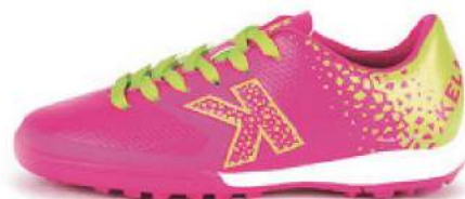
908 - Neon Rose