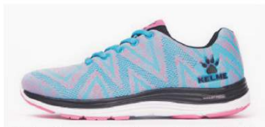
490 - Moon Blue/Rose (WOMEN)