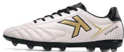
103 - White/Black