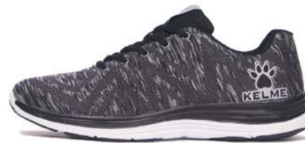
222-Melange Gray (MEN/WOMEN)