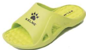
904 - Neon Green