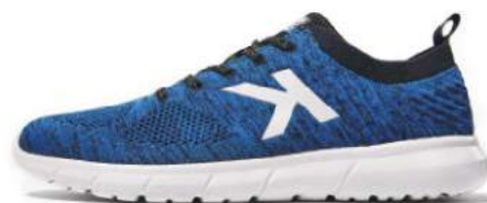
432 - Blue