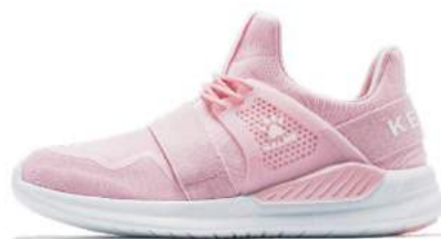
674 - Dynamic Pink (WOMEN)