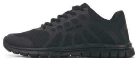
000 - Black