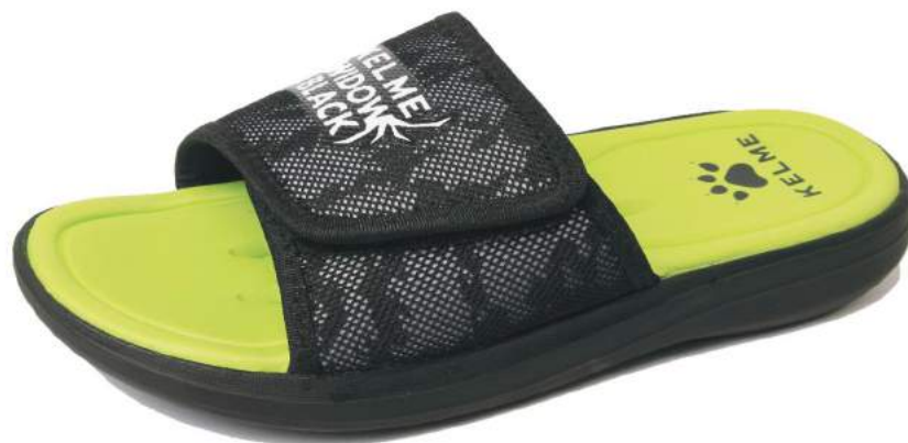
012 - Black/Neon Yellow (6881300)