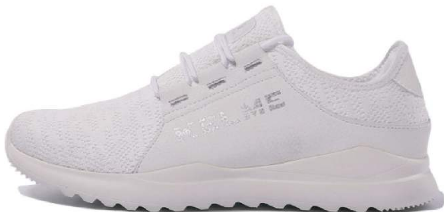
100 - White