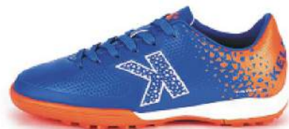
413 - Sapphire Blue/Orange