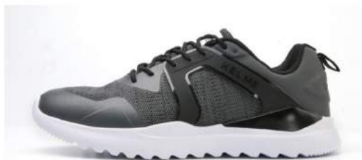
201 - Dark Gray