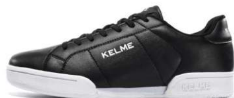
003 - Black/White

Rubber EVA midsole, which is light and comfortable, with classic color- white and black, perfectly meet the needs of minimalist.