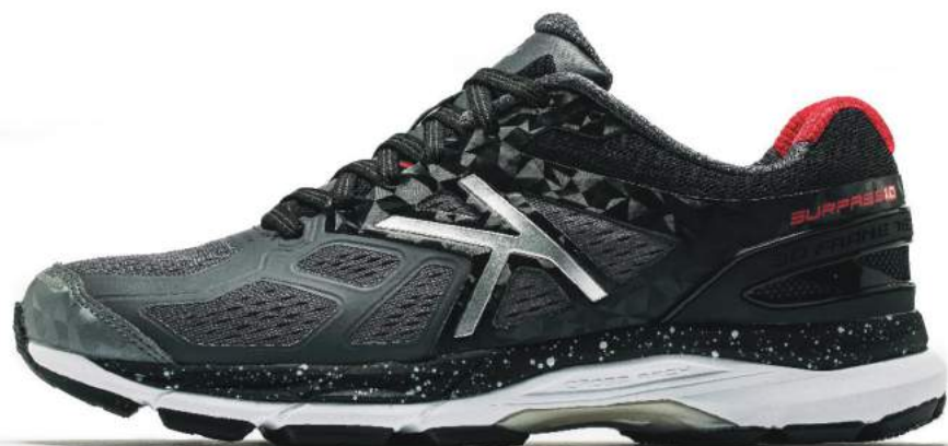
261 - Dark Gray/Black