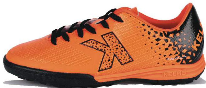
907 - Neon Orange