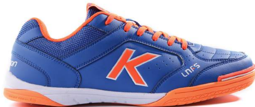
413 - Sapphire Blue/Orange