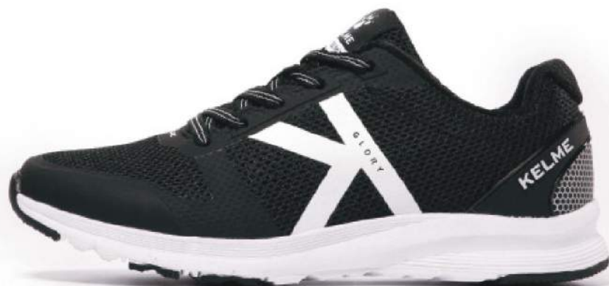
003 - Black/White