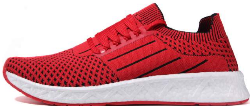
600 - RED