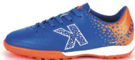
413 - Sapphire Blue/Orange