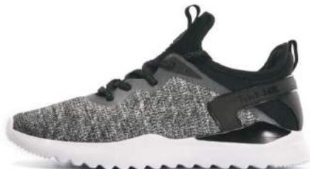
261 - Dark Gray/Black