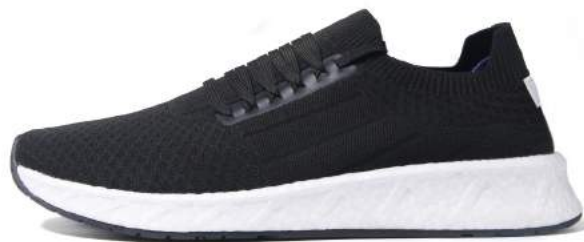
000 - BLACK